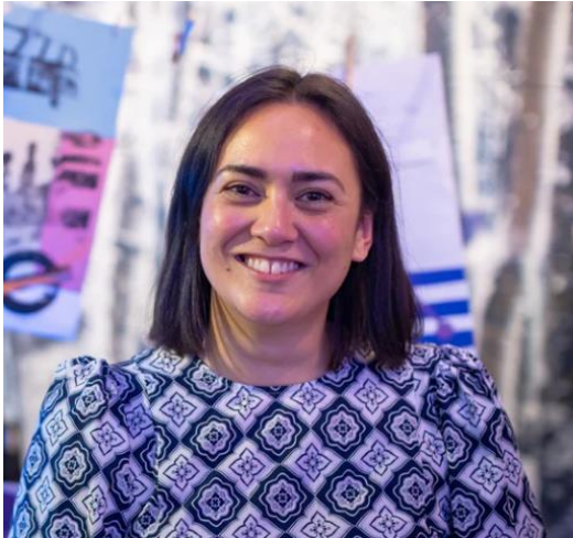
Samantha, 2023.